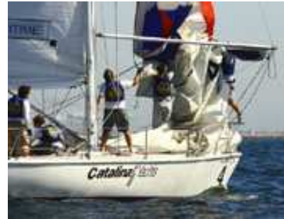
Runnerup Cal Maritime struggles with a spinnaker takedown