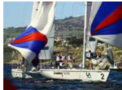
Coast Guard leads Merchant Marine to 1-2 finish in Race 9