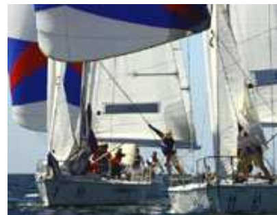
USC and 2-time champion Maine Maritime wage a spinnaker duel