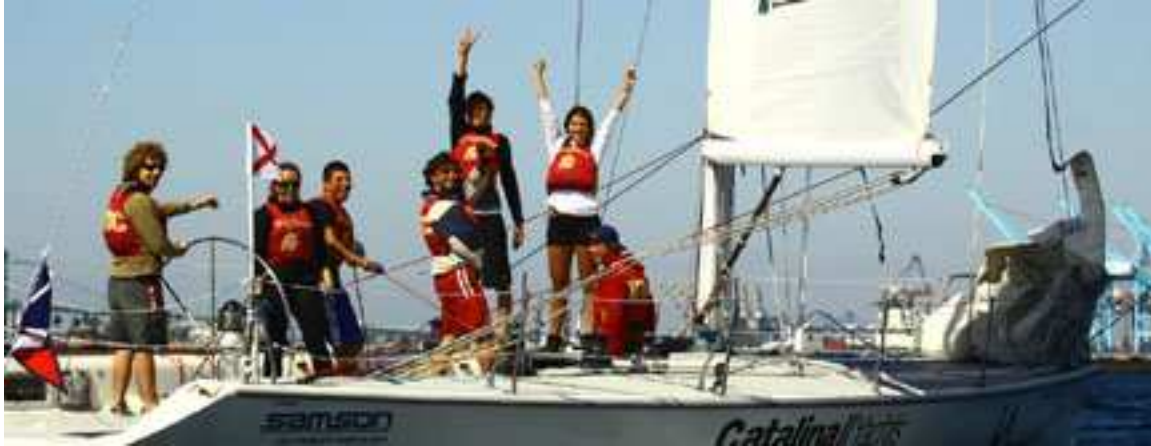
Fight on! USC celebrates victory in Harbor Cup after finishing second to Cal Maritime in last race