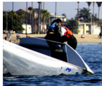
Quick recovery from a flip

Click to view or download hi-res photo gallery