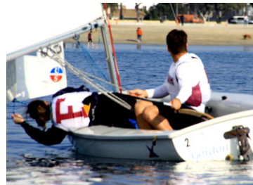
Fordham working its way to the leeward mark