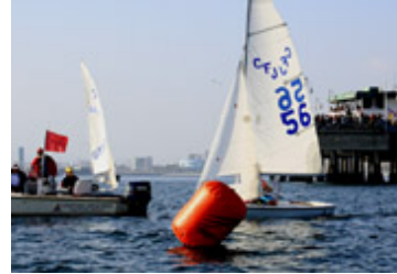
Stanford started the day 1-2