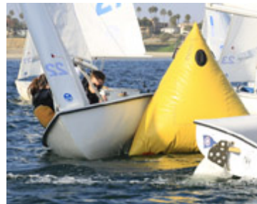
Muscling around the mark