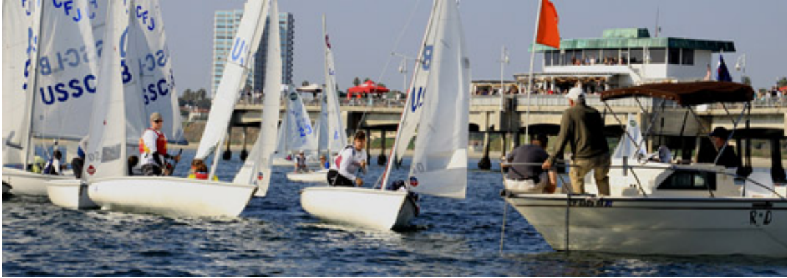
College teams from U.S. (above) and West Coast high schools started Rose Bowl Regatta Saturday