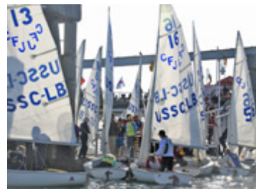
Teams switch boats behind Belmont Pier every 2 races